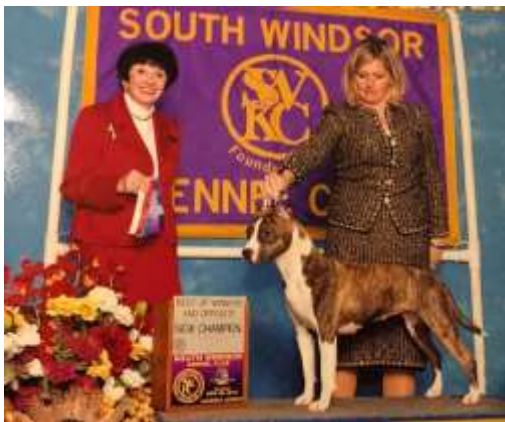
Fraja EC Ticket To Party (F) GP4 – 1 Total Point(s) – 4

Rank #12 – FLK Knockout (M) NO PICTURE Total Point(s) – 2