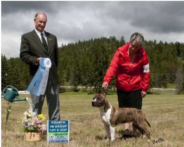
GCh LBK's Release The Kraken (M) GP1 – 1, GP2 – 2, GP4 – 1 Total Point(s) – 86