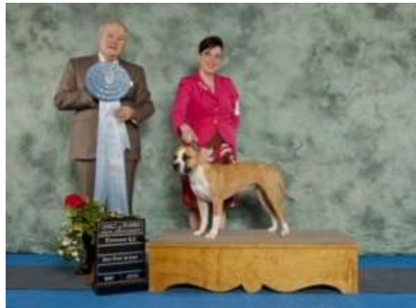
CH Prairie Moon Legend of Zelda (F) GP2 – 3, GP3 – 2, GR4 – 6 Total Point(s) – 97