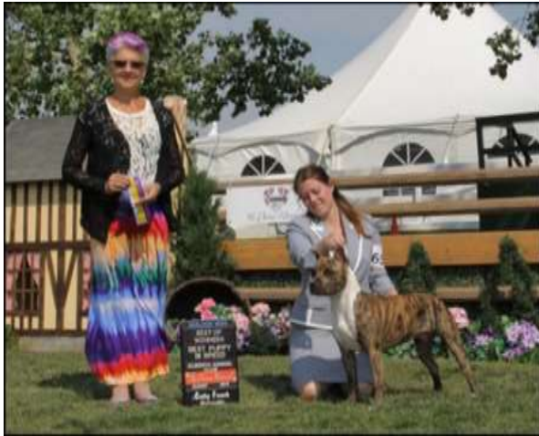
GCh. Blue Nile's Just The Way You Are (F) Total Point(s) – 4