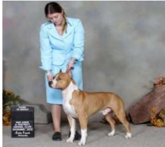
GCh Prairie Moon's Mega Man (M) GP2 – 2, GP3 – 4, GP4 – 4 Total Point(s) – 121