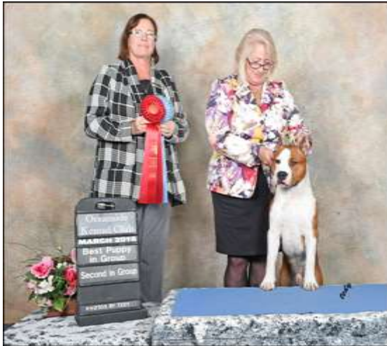
Ch Michl R I Only Dates Models (M) GP1 – 6, GP2 – 11, GP3 – 7, GP4 – 5 Total Point(s) – 562