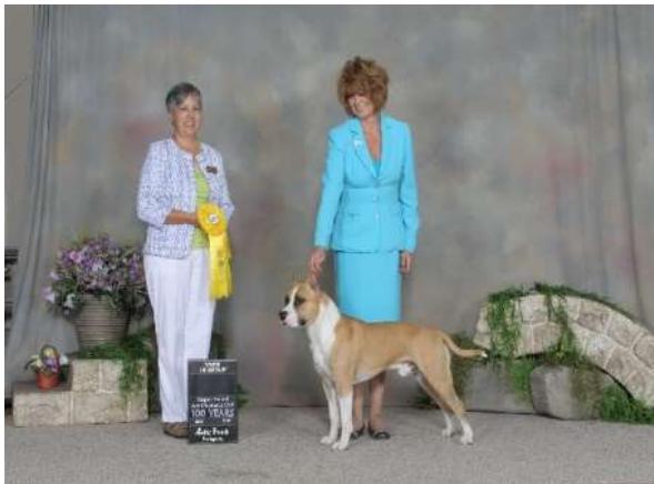
GCh Chargers Gazella All For Glory (M) GP1-4, GP2 – 3, GP3 – 8, GP4 – 9 Total Point(s) – 313