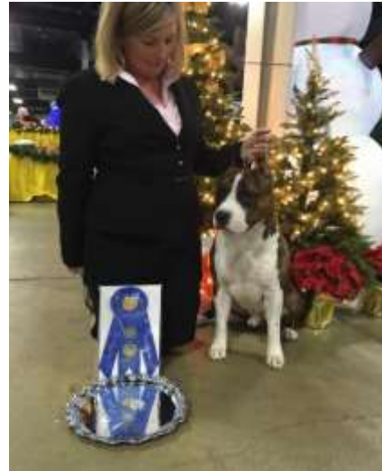
Ch Roadhouse's Life Of The Party (M) GP1 – 1, GP3 – 1, GP4-1 Total Point(s) – 65