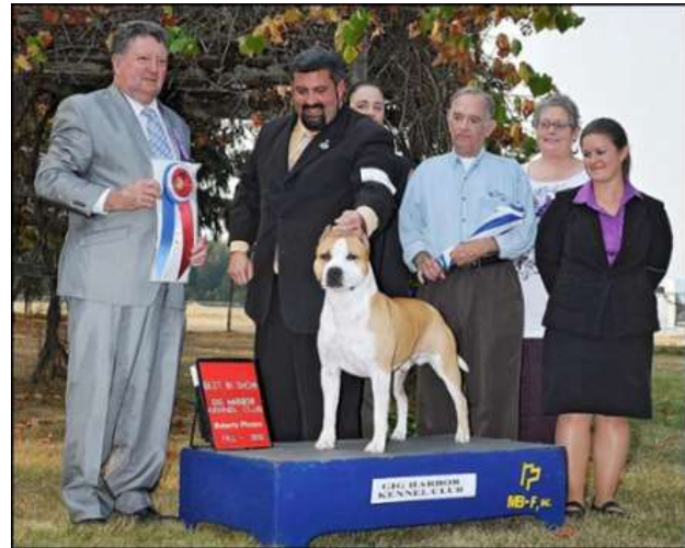
Alpine's Ring Of Fire (M) GP2 – 1, GP4 – 1 Total Point(s) – 48