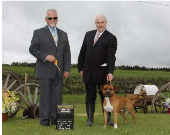
Ch Marauders Revolution (M) Total Point(s) – 3